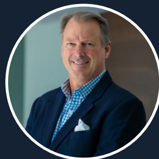
SANDY BROWN COMMISSIONER – MAJOR LEAGUE LACROSSE